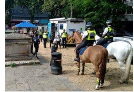
Anti Social Behaviour Awareness Week