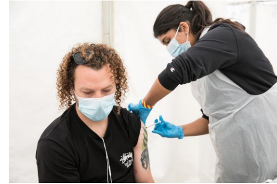
Covid-19 Vaccine Helpline